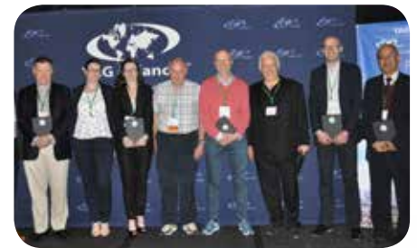
Founding TIAG Members receiving their “Member Loyalty Awards”