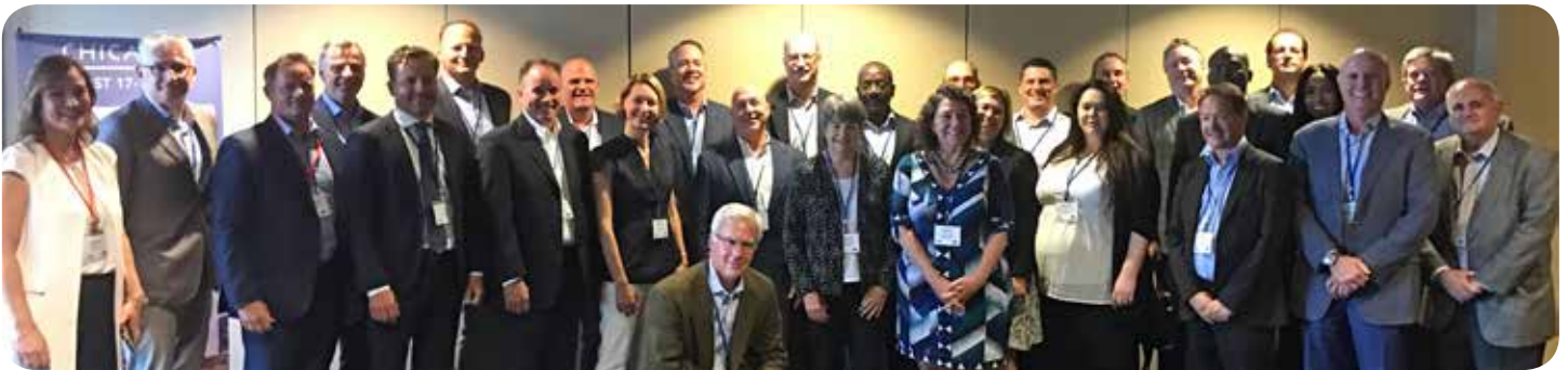
Over 30 TAG Alliances Members from seven different countries attended this year's Managing Partner Summit in Chicago, Illinois.