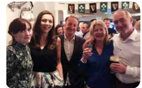
Networking time at the TAG Alliances UK & Ireland Meeting in Kenmare, Ireland.