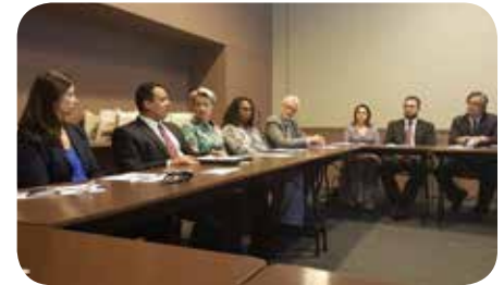
Attendees in session at the TIAG Brazilian Regional in Rio de Janeiro.