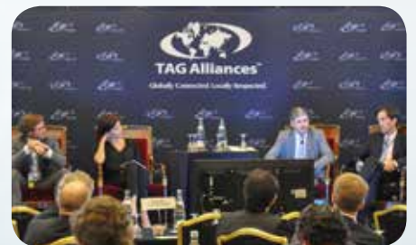
“International Legal and Accounting Engagements: A View from the Driver’s Seat”