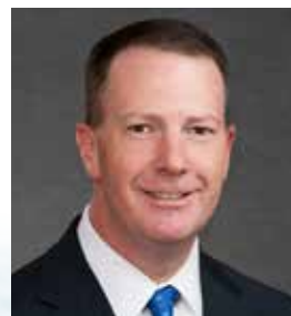
Greg Noschese Munsch Hardt Kopf & Harr, P.C. (Texas, USA)