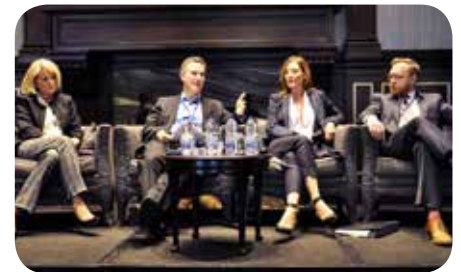
"Litigation & ADR and Audit & Assurance: Oops...What Happens When Auditors Miss Fraud" panelists.