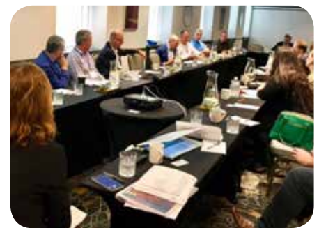
"What Keeps you Up at Night" round table session.