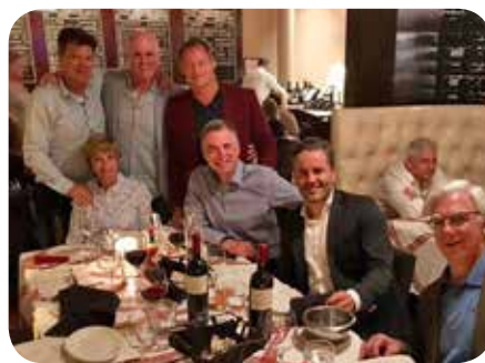
Summit attendees pose at the Opening Dinner.