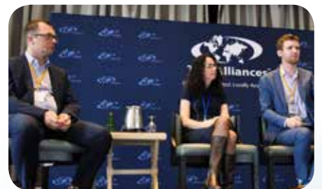
"The Black Mirror" The Impact of Technology on the Legal and Accounting Professions