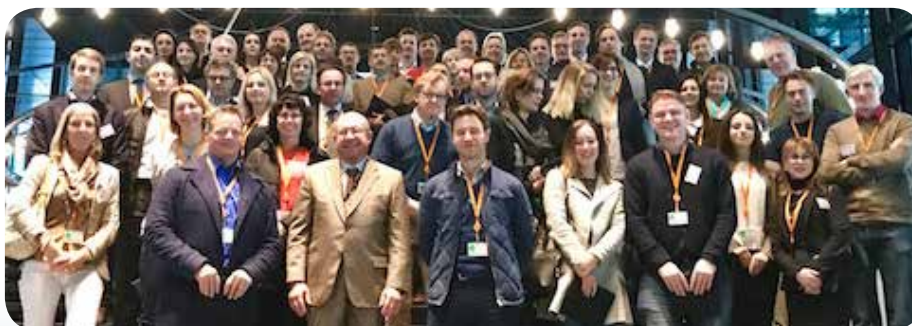
Members attend the TAGLaw European Regional Meeting in Luxembourg.