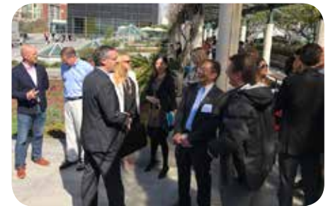
Attendees network at the TAGLaw Western North America Regional Meeting reception.