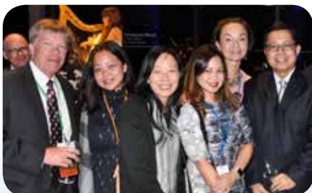
Networking with new and old friends at the Gala Dinner.