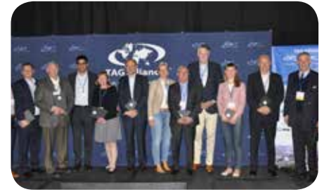
Founding TAGLaw Members receiving their “Member Loyalty Awards”