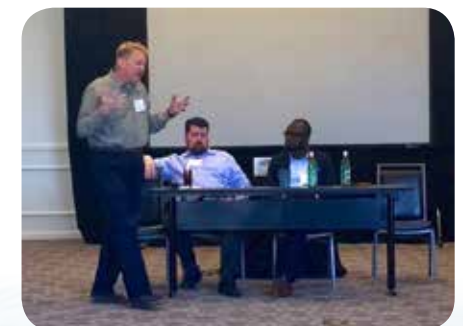
Bone Law attorneys presenting at the TAGLaw SE / MW Regional Meeting in Nashville.