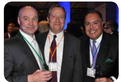
The Triple Threat! Members from TAGLaw, TIAG and TAG-SP networking at the Gala Dinner.