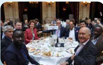
“Doing Business in Africa” Networking Lunch Table