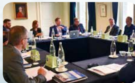
Discussing alliance updates and strategy at the TIAG Advisory Board Meeting