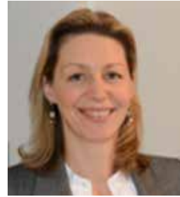
Florence Bastin Fiduciaire du Grand-Duché de Luxembourg S.à r.l. (FLUX) (Luxembourg)