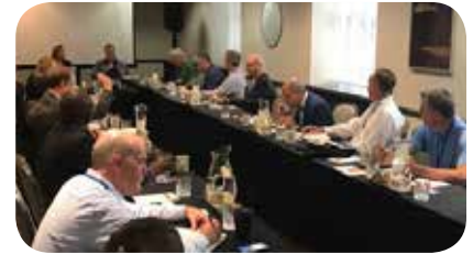
Day one of the TAG Alliances Managing Partner Summit.