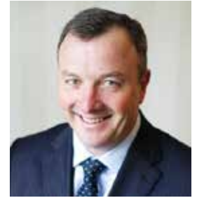
Basil Bielich Browne Craine and Co. (Isle of Man)