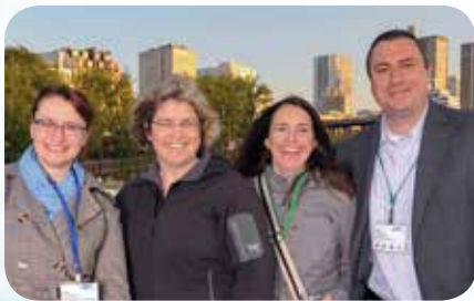
Delegates from Williams Mullen (North Carolina & Virginia - TAGLaw), Mallette (Quebec - TIAG) & Cohen & Company (Michigan & Ohio) on the Seine Networking Dinner Cruise.